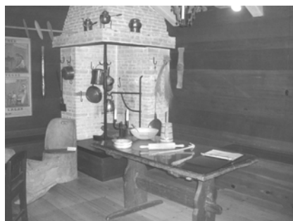
Stuga featuring corner fireplace

The building's design is based on a 17th century manor house in Sweden. The architect, John Nyden, a Swedish-American from Chicago, combined Swedish and American elements by modeling the exterior arcades on those of Mount Vernon. The cupola is a copy of the one atop Stockholm’s City Hall.