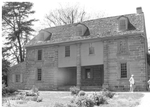
View of Bartram’s house on the river side

The next stop was Bartram’s Garden the oldest surviving botanic garden in America. The garden is on the site of noted American botanist John