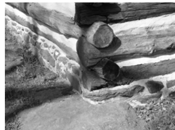
Note notched logs resting on a boulder

Although much altered, its Scandinavian roots can be seen in features such as logs left round with the bark on, corner fireplaces completely inside the building, distinct extended corner notching of the logs and the fact