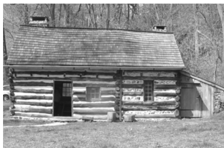
Swedish Log Cabin

The house, gardens and related business activities remained in the family until 1850 when financial difficulties led to the sale of the property outside the family to Andrew Eastwick. Upon Eastwick's death in 1879 a campaign was organized to preserve the estate. In 1891 control of the site was turned over to the City of Philadelphia and it remains protected as a city park.