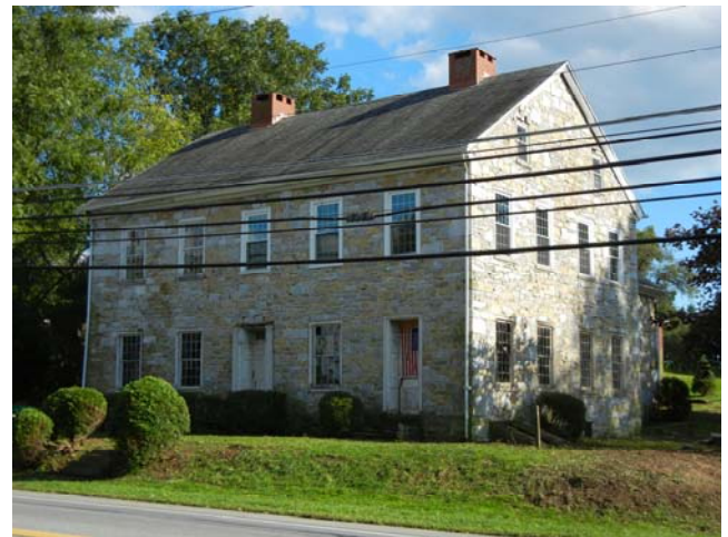
Hain-Ruth House, (1815) on Rt. 422 in Sinking Springs

Presently, the Hain-Ruth house is gravely threatened. Now owned by the YMCA, the house is tentatively on the market for purchase or lease. The Historic Preservation Trust of Berks County is endeavoring to find partners in an initial effort to secure the building, and then find buyers/tenants for a possible commercial venture in this large structure. Shops, a restaurant, or headquarters for an architectural or drafting firm are among possibilities being explored.