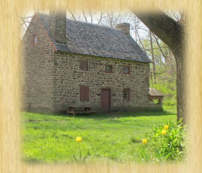
Upcoming Events at a Glance

June 17 – 3<sup>rd</sup> Saturday Program July 15 – Keim Open House August 19 – 3<sup>rd</sup> Saturday Program Sept. 16 – 3<sup>rd</sup> Saturday Program Sept. 30 – Keim Music Fest Oct. 21 – 3<sup>rd</sup> Saturday